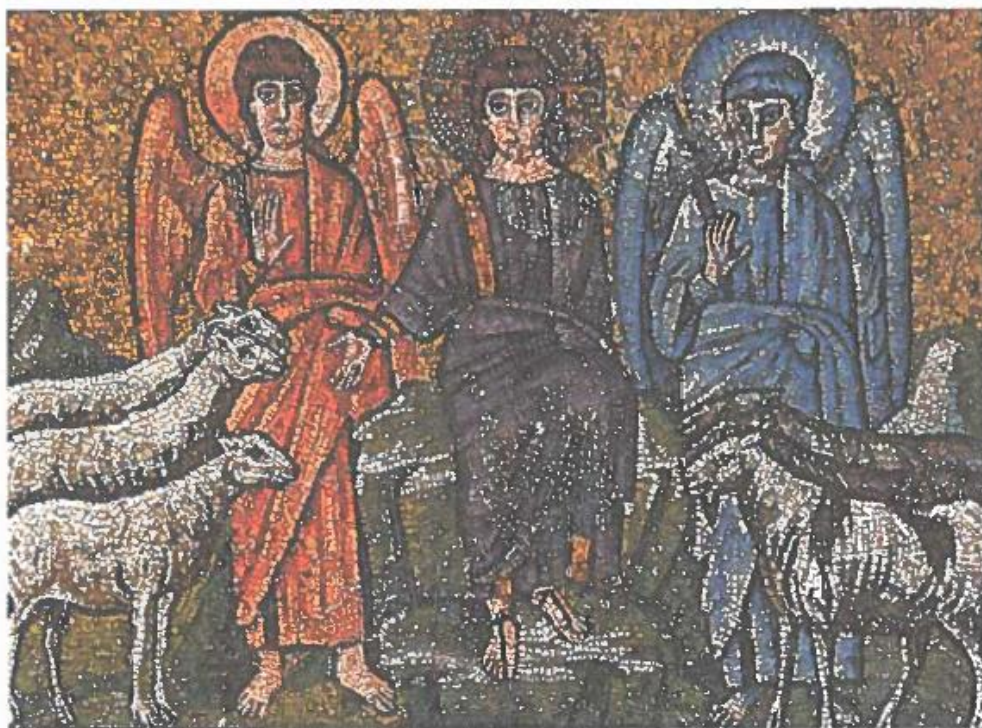
An Ancient Mosaic of the Last Judgment. Christ is enthroned, separating the sheep from the goats.